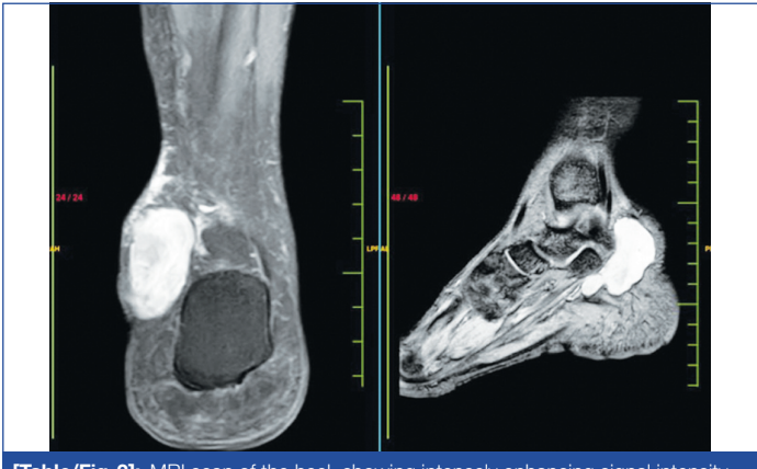
[Table/Fig-2]: MRI scan of the heel, showing intensely enhancing signal intensity lesion on medial aspect of ankle joint.