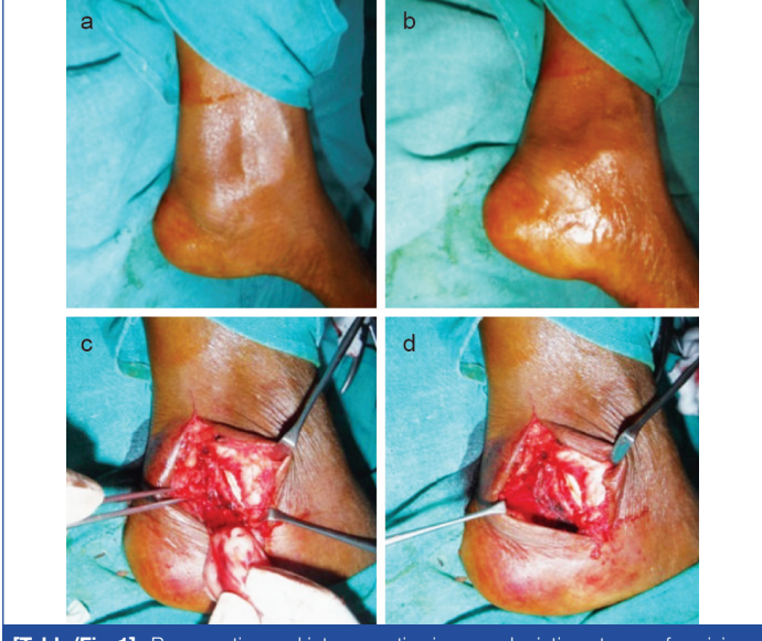
[Table/Fig-1]: Preoperative and intraoperative images depicting stages of excision of swelling.

The patient underwent excisional biopsy of the lesion, and a single whitish-brown tumour was removed for histopathological analysis [Table/Fig-3]. The analysis revealed that the outer smooth muscle layer was whirled away from the vessels and blended with the peripheral smooth muscle fibres, which suggested a benign mesenchymal tumour with mild nuclear atypia [Table/Fig-4]. To arrive at a definitive diagnosis, immunohistochemistry markers such as Smooth Muscle Actin (SMA) and S-100 were performed. The tissue was positive for Alpha-SMA and Vimentin, and negative